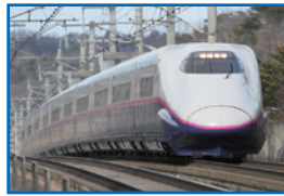
Jōetsu Shinkansen "TOKI" etc. Jōetsu Shinkansen (333.9 km) Train Names: TOKI, TANIGAWA, Max-TOKI, Max-TANIGAWA