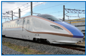
Hokuriku Shinkansen "KAGAYAKI" etc. Hokuriku Shinkansen (450.5 km) Train Names: KAGAYAKI, HAKUTAKA, TSURUGI, ASAMA