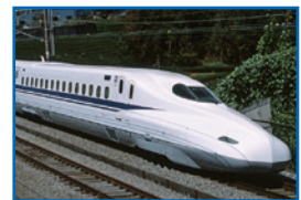
Tōkaidō & San'yō Shinkansen "HIKARI" Tōkaidō Shinkansen (552.6 km) Train Names: NOZOMI*, HIKARI, KODAMA