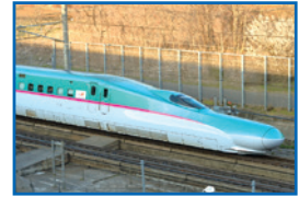
Hokkaido Shinkansen "HAYABUSA" etc. Hokkaido Shinkansen (148.8 km) Train Names: HAYABUSA, HAYATE