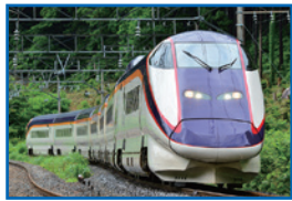
Yamagata Shinkansen "TSUBASA" Yamagata Shinkansen (421.4 km) Train Name: TSUBASA