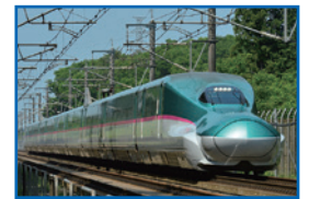
Tōhoku Shinkansen "HAYABUSA," "YAMABIKO" etc. Tōhoku Shinkansen (713.7 km) Train Names: HAYABUSA, HAYATE, YAMABIKO, NASUNO