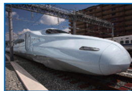
San'yō & Kyūshū Shinkansen "SAKURA" San'yō Shinkansen (622.3 km) Train Names: NOZOMI*, MIZUHO*, HIKARI (incl. HIKARI Rail Star), SAKURA, KODAMA (Tokyo thru Hakata, 1,174.9km)