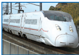
Kyūshū Shinkansen "Series 800" Kyūshū Shinkansen (288.9 km) Train Names: MIZUHO*, SAKURA, TSUBAME